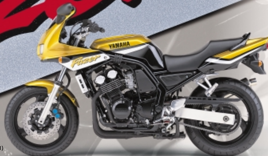
DRYC1 (Deep Reddish Yellow Cocktail 1)