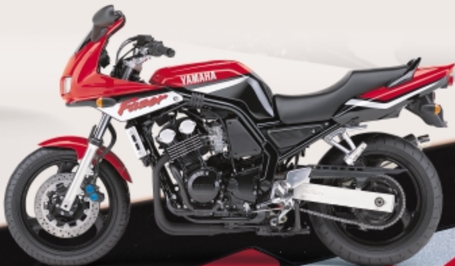
VRC1 (Vivid Red Cocktail 1)